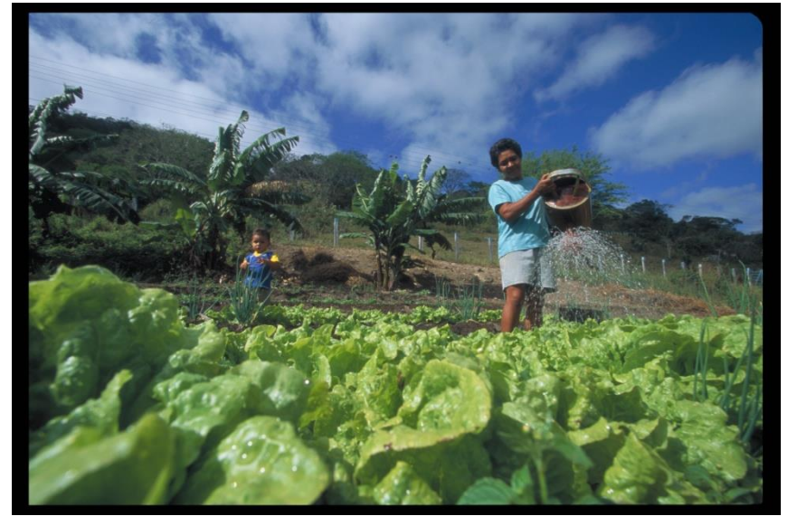
Brazil: Large Farms