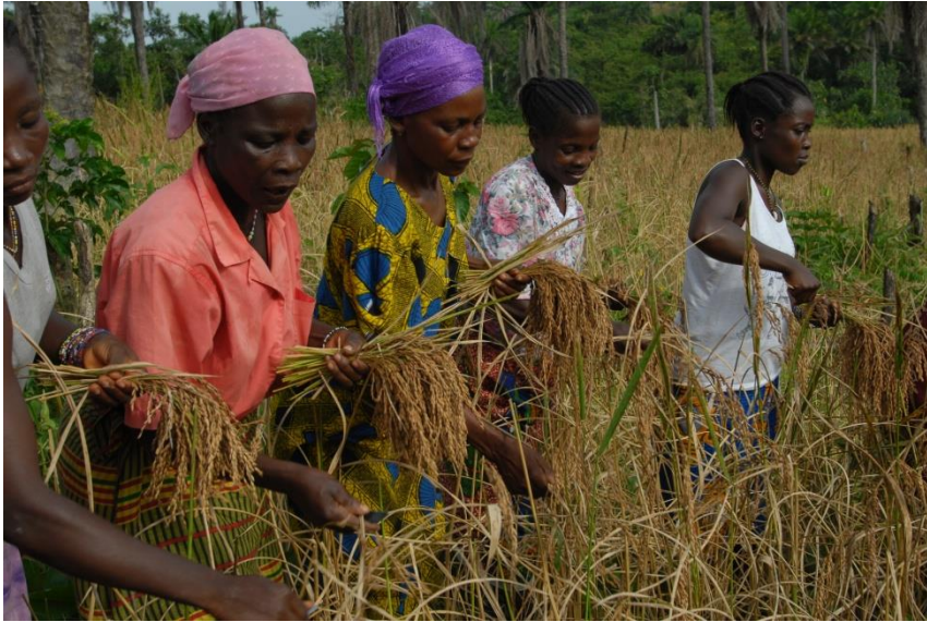
Liberia: Rice Farming